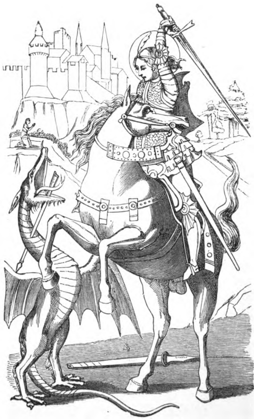
S. George (Carlo Crivelli.)